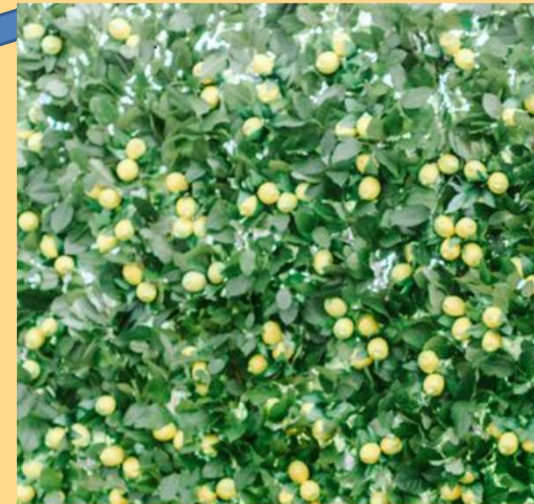
Flowers and lemon backdrop