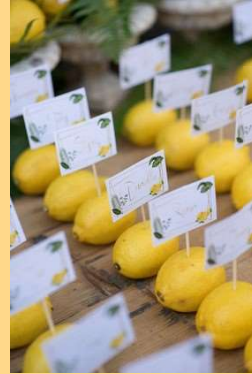
Name tag - lemon( see the photo)