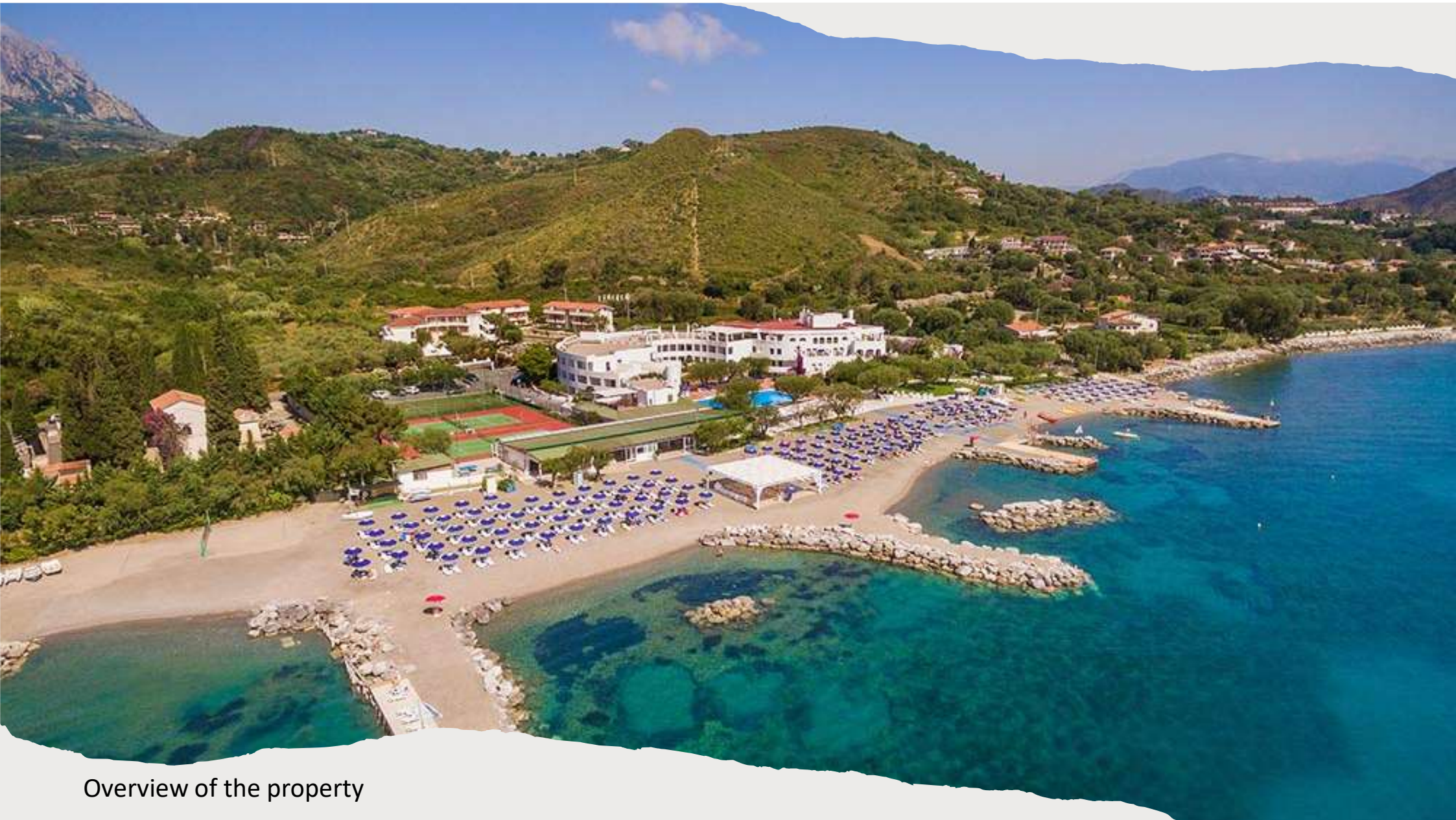
Overview of the property