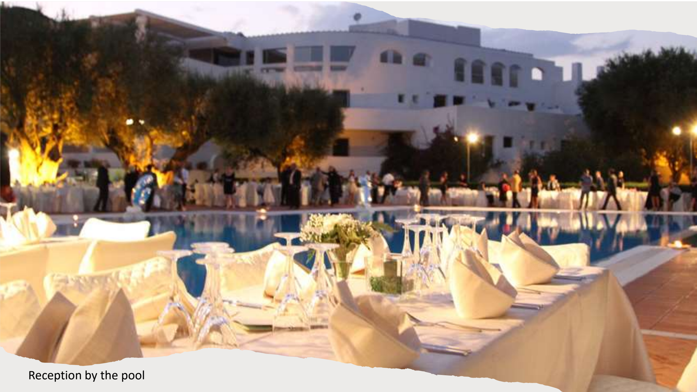
Reception by the pool