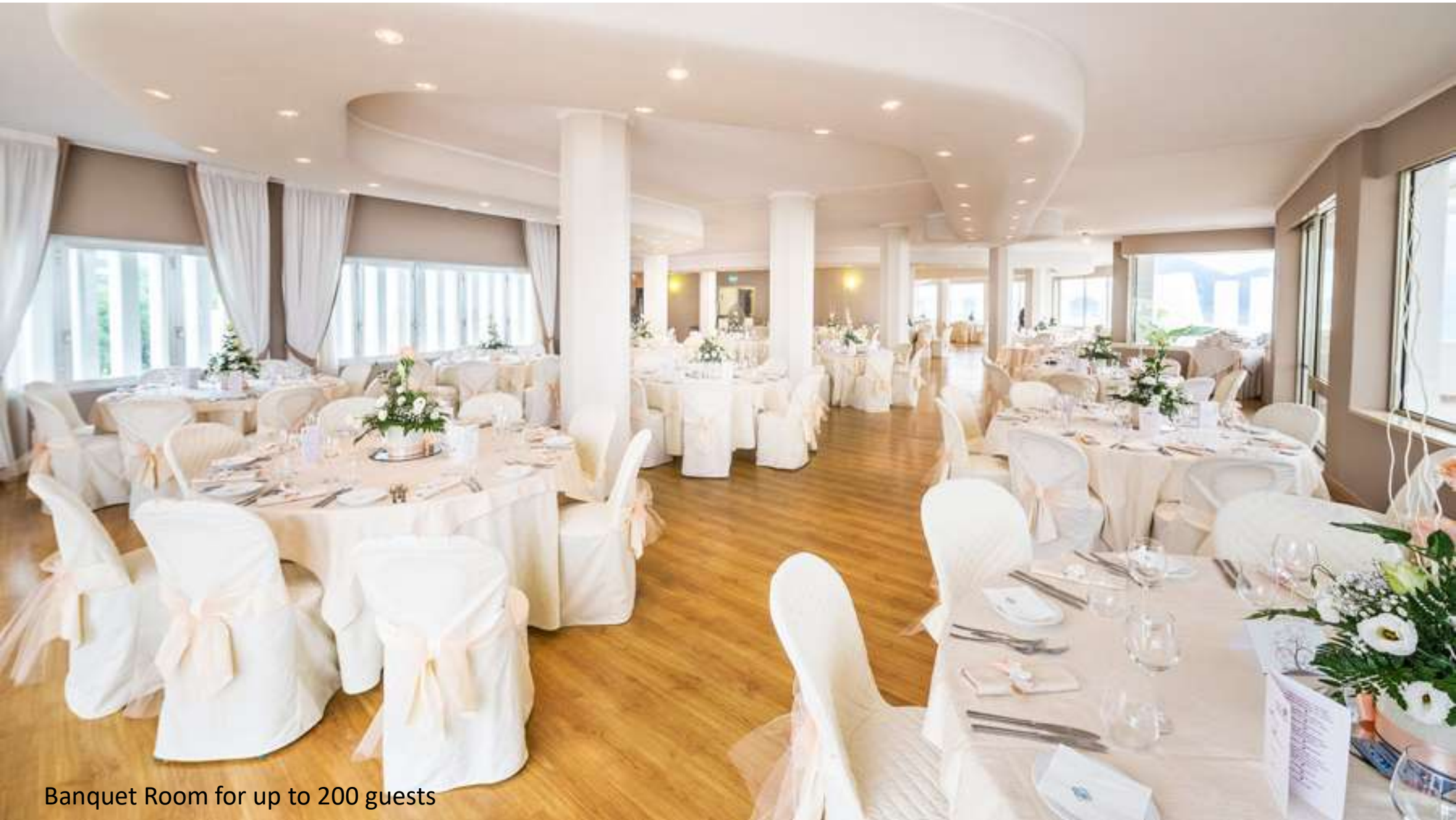
Banquet Room for up to 200 guests