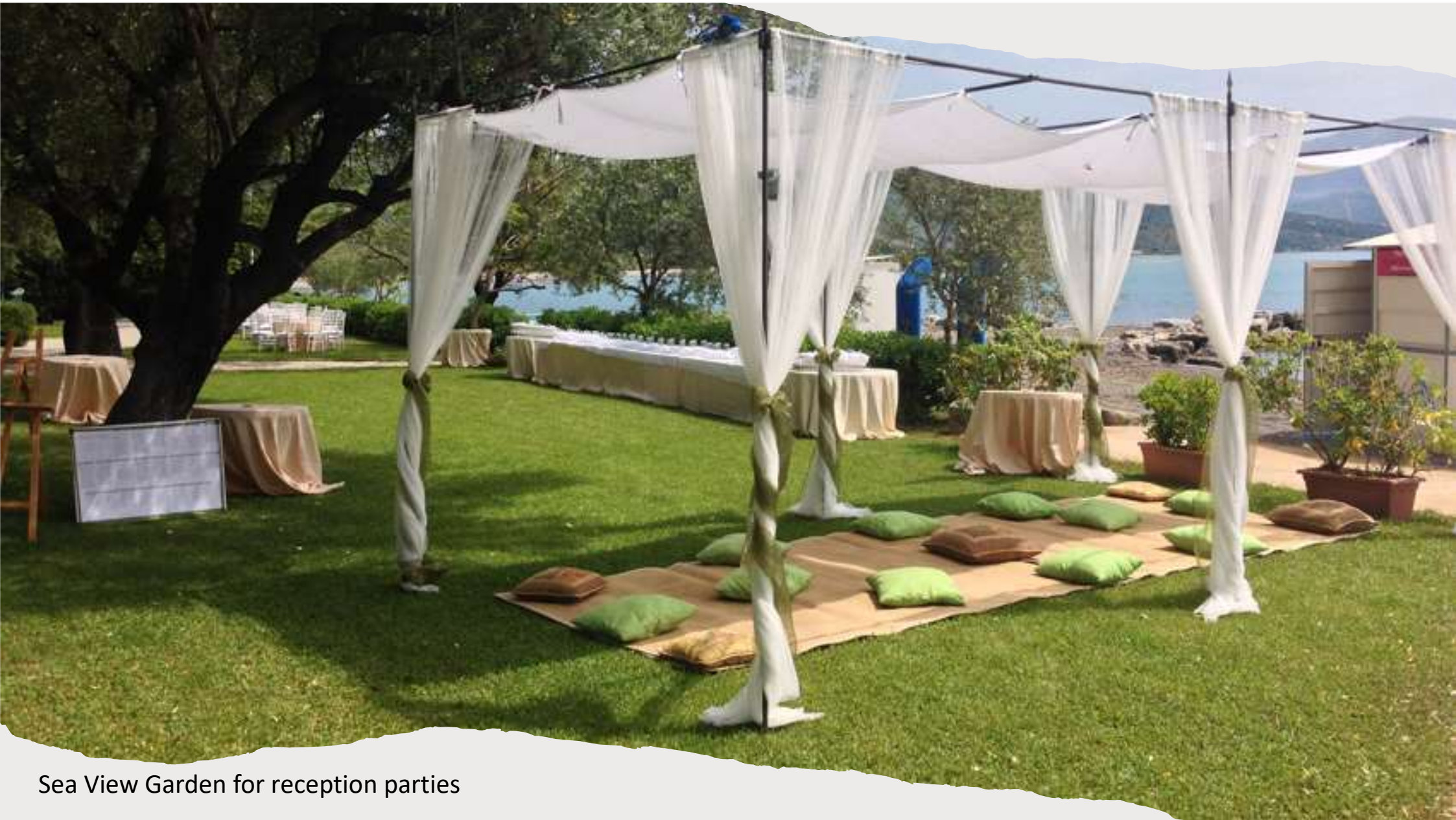
Sea View Garden for reception parties